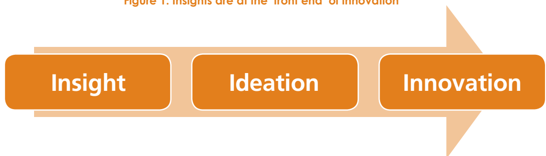
Figure 1: Insights are at the 'front end' of innovation

Innovation is a multi-phase process and, in order to innovate successfully, organisations have to manage each of the different phases effectively. Conceiving and generating new ideas ('ideation') is the most vital 'front-end' phase of this creative process, but ideation itself is driven by the insights which foster individual employees' creativity. Therefore, in order to manage innovation, managers need to understand the 'front end' and know how to manage it more effectively (Fiedler 2012, Reinig et al 2007) (see Figure 1).