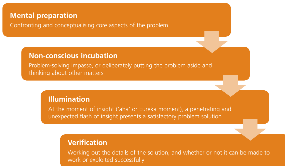
Figure 2: Wallas's four-stage model of the insight process (based on description in Seifert et al 1995)

The phenomenon of insight may be familiar to many of us: it's the sudden appearance of a solution ('illumination'), often when we're least expecting it, to a problem that's been perplexing us for some time (an 'impasse'). One of the key ideas that emerged from Wallas's model and subsequent research is that we can sometimes think too hard; solutions to difficult problems as well as great ideas rarely turn up on demand.